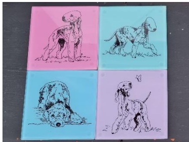
Glass Coaster sets