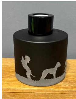
Hand Etched Reed Diffuser

We do ship overseas, please contact the secretary for details of postal charges.